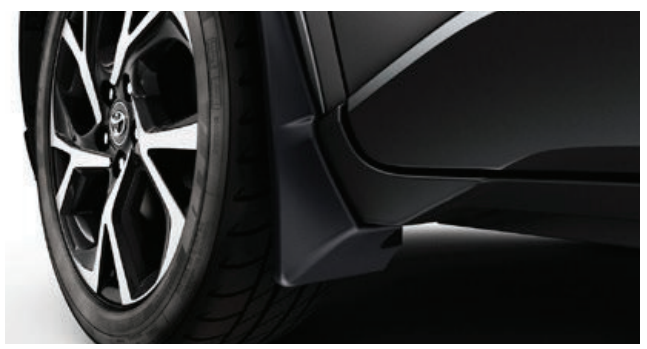
FRONT & REAR MUD GUARDS Designed to minimise water, mud and stones spraying onto your car's body.