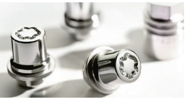
LOCK NUTS Replacing one nut on each wheel with a Toyota hardened steel wheel lock will maximise security for your valuable alloys.