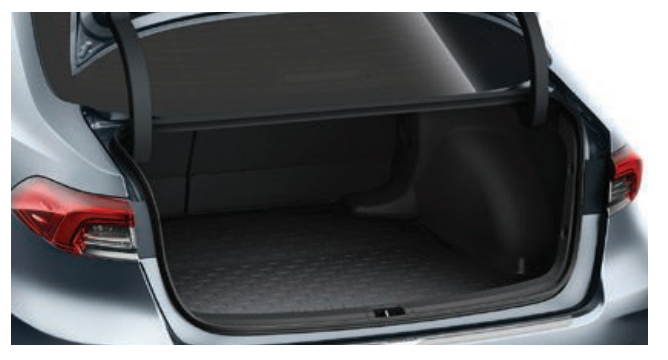
BOOT LINER Tailored to fit the boot of your vehicle and provide protection against dirt and spills.